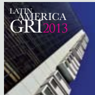
LATIN AMERICA GRI 2013 Miami, 16-17 April