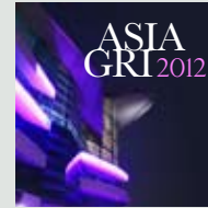
ASIA GRI 2012 Hong Kong, 4-5 December