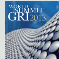
WORLD SUMMIT GRI 2013