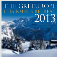
THE GRI EUROPE CHAIRMEN'S RETREAT 2013 St Moritz, January