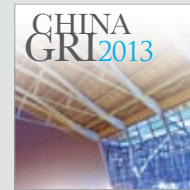
CHINA GRI 2013 Beijing, June