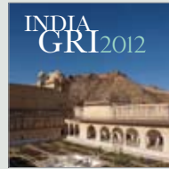
INDIA GRI 2012 Mumbai, 3-4 October