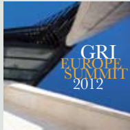
GRI EUROPE SUMMIT 2012 Paris, 11-12 September