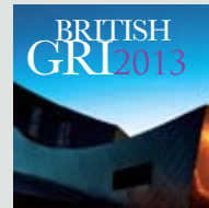
BRITISH GRI 2013 London, 8-9 May