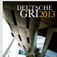
DEUTSCHE GRI 2013 Frankfurt, April