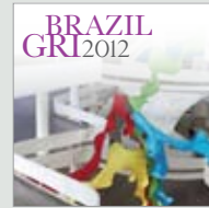
BRAZIL GRI 2012 Sao Paulo, 6-7 November