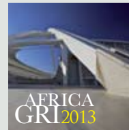
AFRICA GRI 2013 Nairobi, June