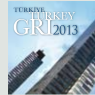
TURKEY GRI 2013 Istanbul, 8-9 January