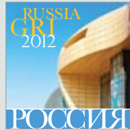
RUSSIA GRI 2012 Moscow, 19-20 September